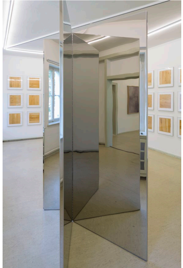
Adrian Sauer, Spiegel mit einem Band , 3 pieces, polished stainless steel, wood, piano hinge, each wing 225 x 90 x 2,5 cm, 2015